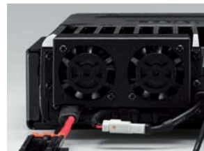
Optional CFU-F8100 fitted to the rear panel.