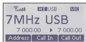
Function button menus are shown at the bottom of the display

The following functions can be assigned to the [I], [II], and [III] function buttons: Main menu, Manager menu, Set mode, Selcall address list, RX history, and TX history.