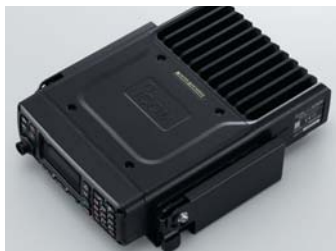
IC-F8101 with optional MB-126.

The IC-F8101 has a durable, enclosed structure securely sealed from intrusion by all potential elements, and is a visibly compact package. The IC-F8101 and the CFU-F8100